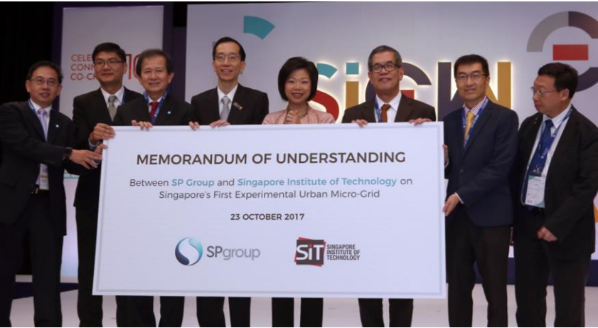
Singapore's first urban university campus micro-grid: targets zero-emission