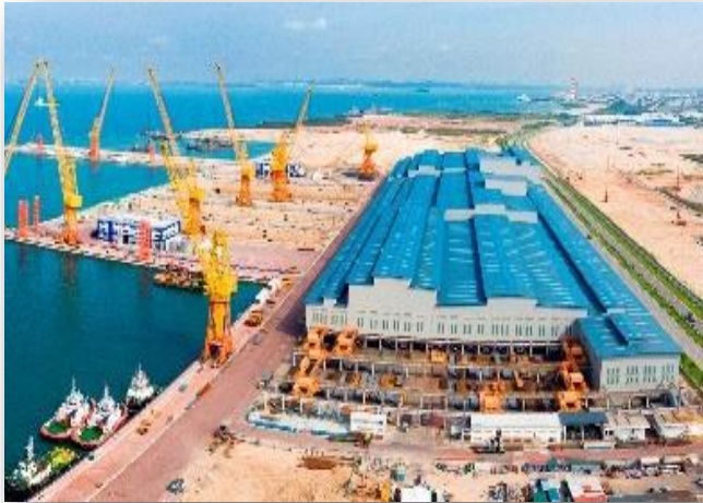
Largest solar rooftop in Singapore with AI-powered digital system