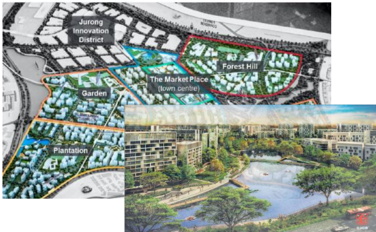
Developing Singapore's first smart energy town in Tengah